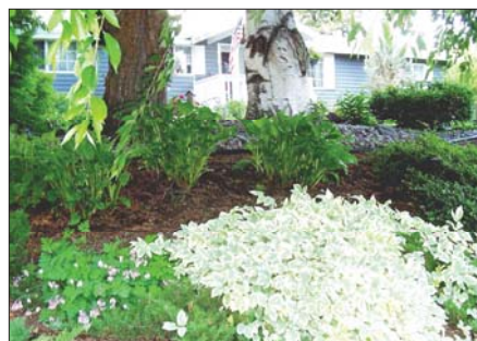
Planting ground covers or mulched shrub beds around trees can protect them from turf care equipment as well as conserve water.

But don't over water either! To determine if trees are getting enough water, and how deep it is going, purchase an inexpensive water meter at your home and garden store.